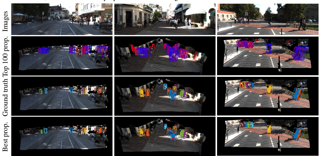
Figure 5: Qualitative examples for the Pedestrian class.